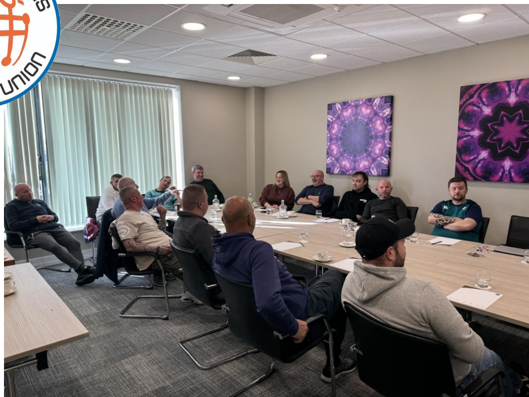
Campaign Planning Day September 2024